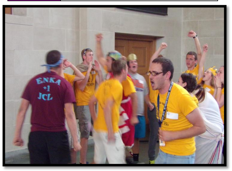
The delegates from Enka High School cheer during last year's State Convention's spirit competition.

There will be two new tests this year: Greek History and Greek Derivatives.